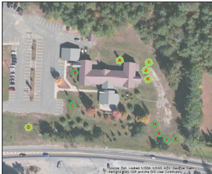
Arbor Day / Earth Day Commemoration Map

GIS Map Production - Staff produced a map of Arbor Day tree plantings at the Agency office in Ray Brook.