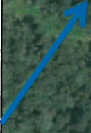
Aerial Photo of Project Site