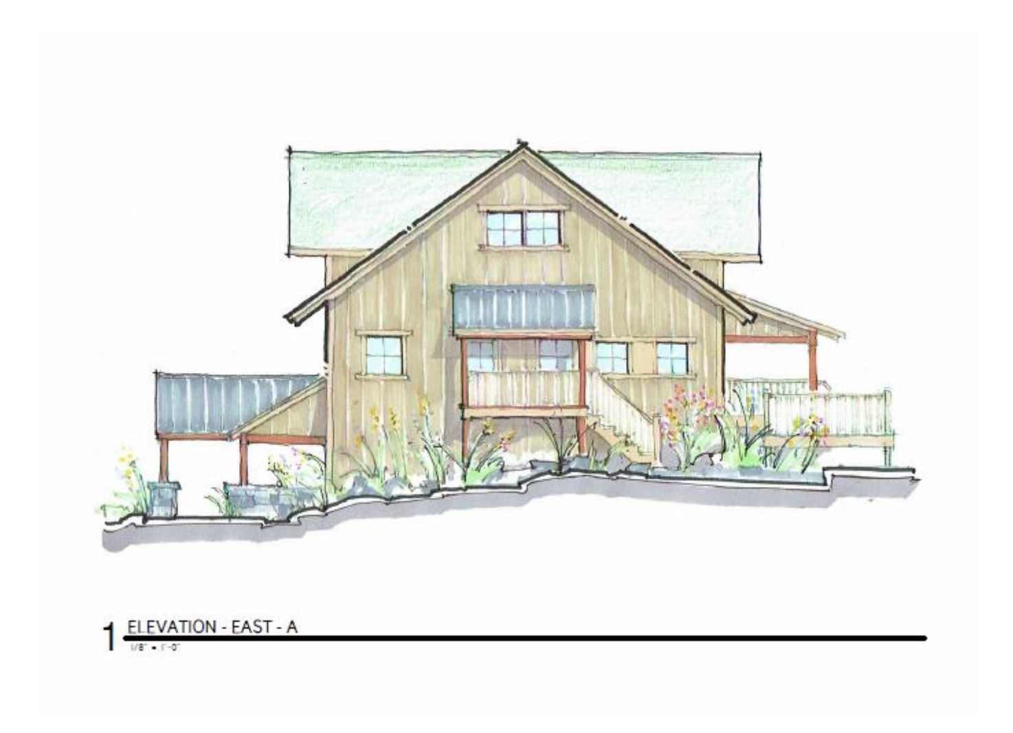
Figure 7. Proposed building site profile: side