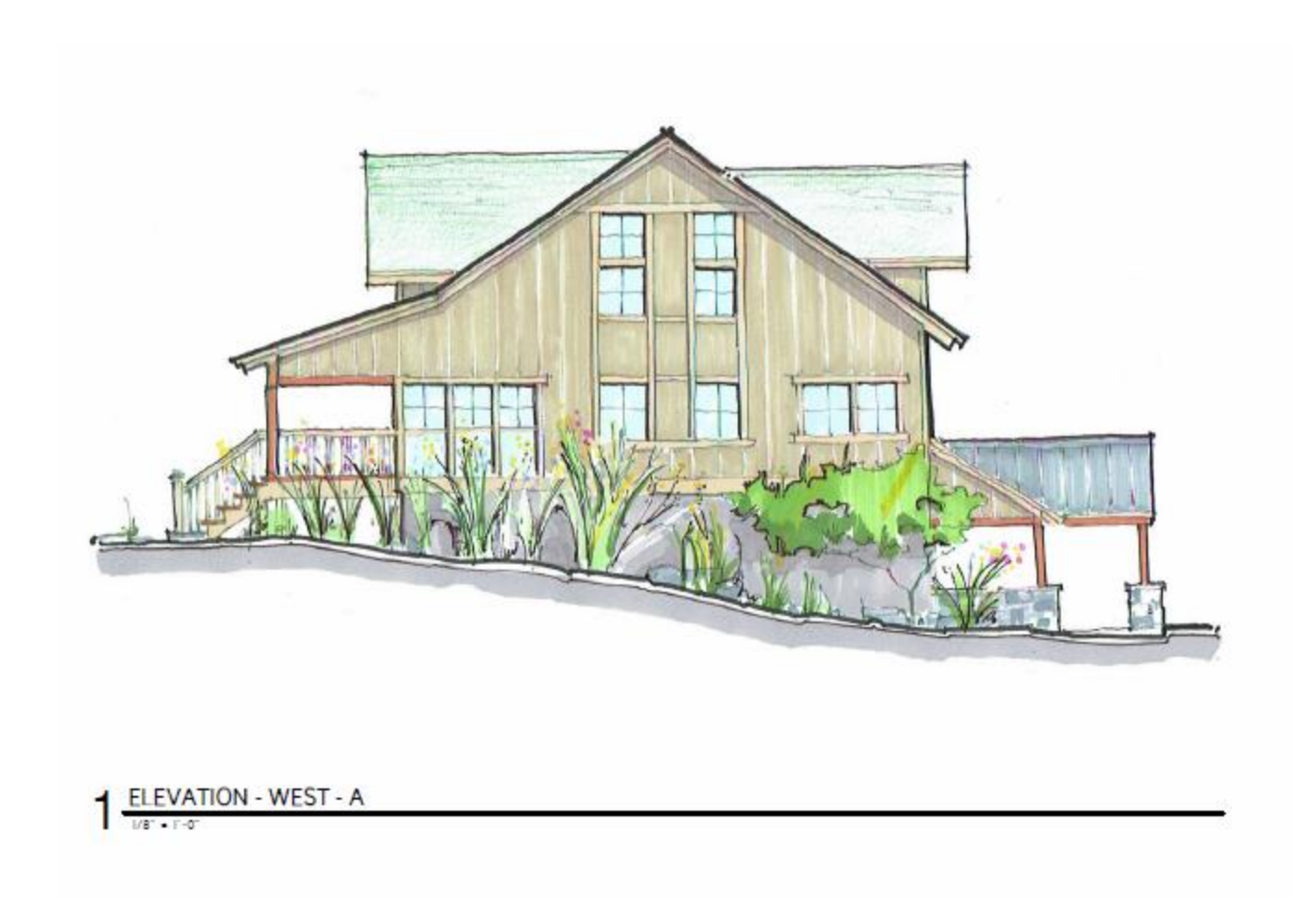
Figure 8. Proposed building site profile: side