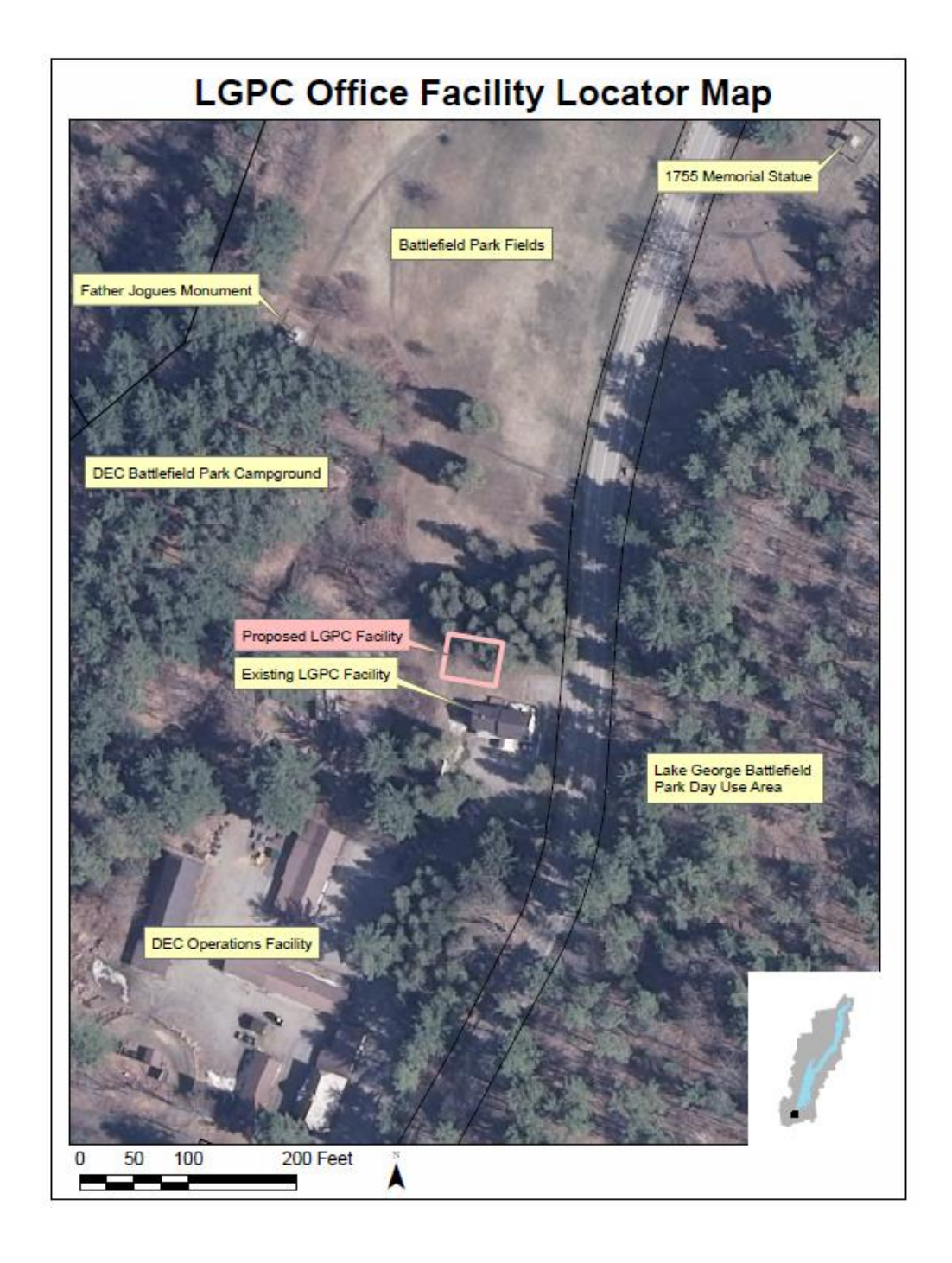
Figure 1. Orthoimagery location and facilities map for the Ramsey House site at the DEC Battlefield Park; Town of Lake George in Warren County, New York.