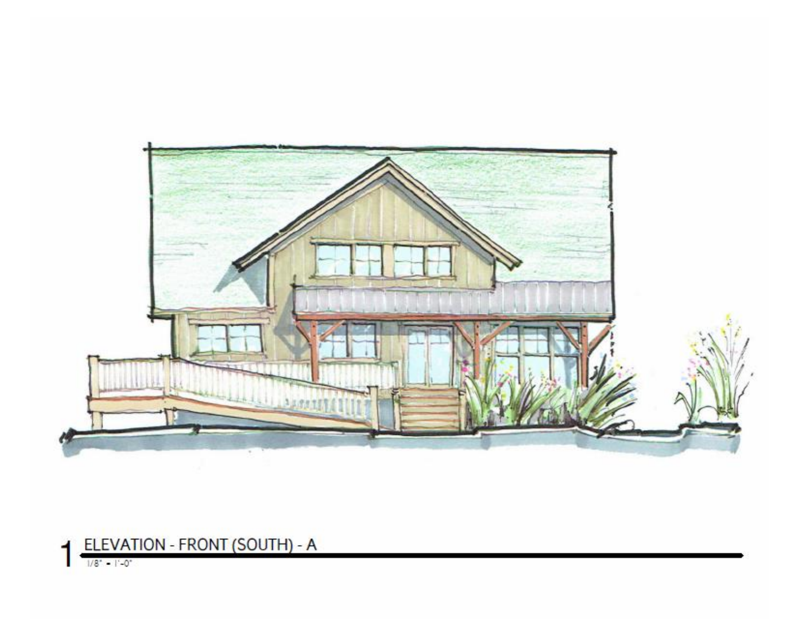
Figure 5. Proposed Building site profile: front, facing south