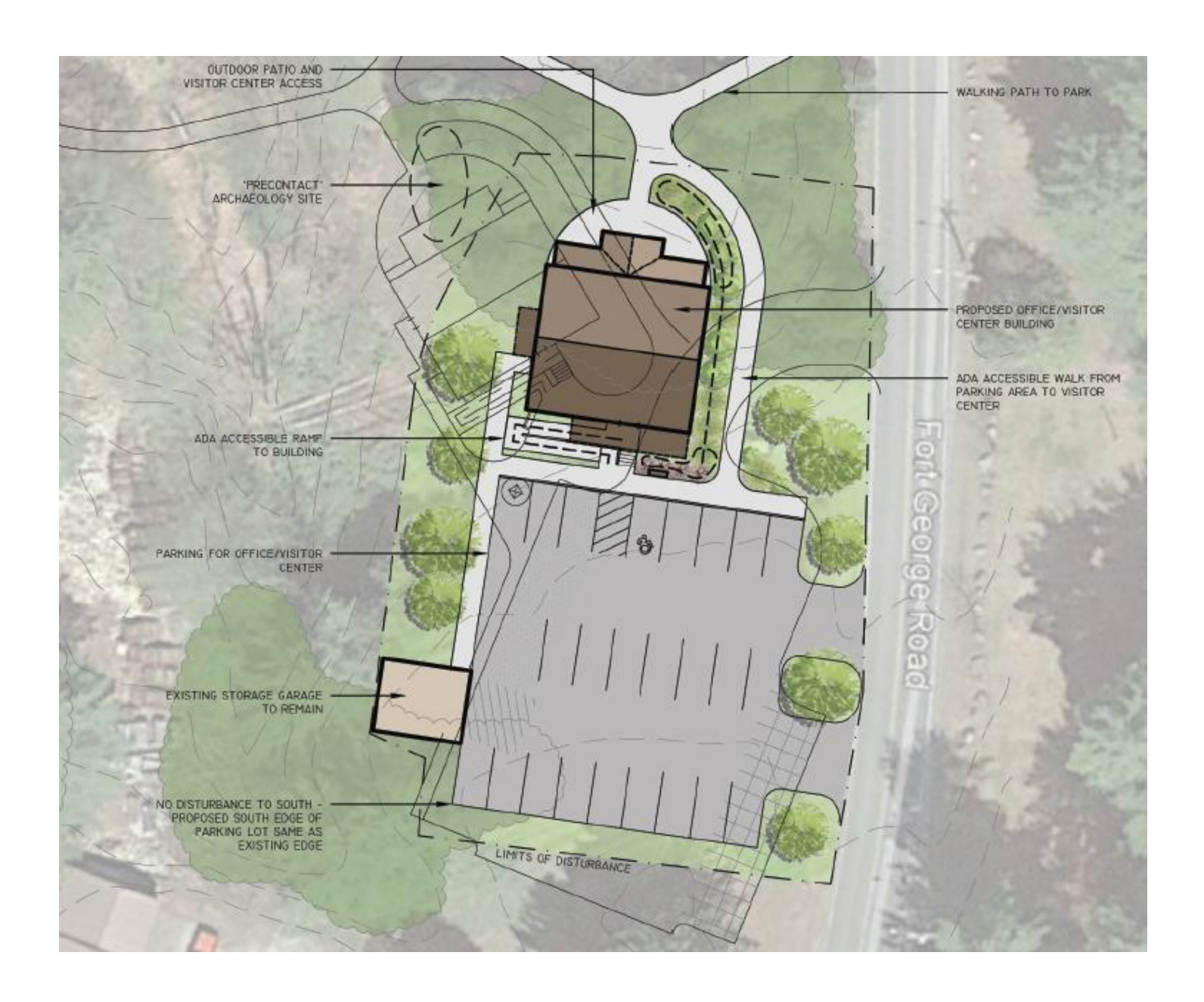
Figure 3. Proposed site plan layout for new facility. Previous proposed location shown outlined. "Pre-contact" archaeological fragments identified to the northwest of proposed building. Project will not impact this area.