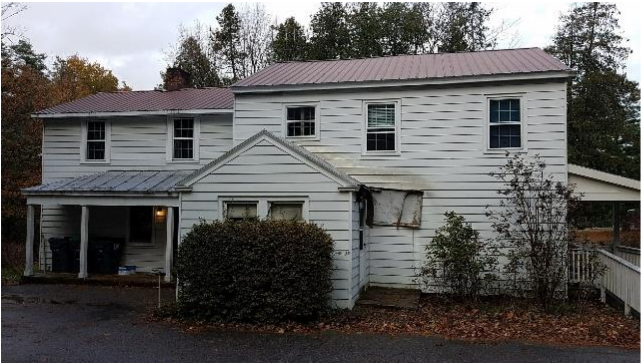
Figure 2. Photos of existing 140 year old "Ramsey House" building, which houses the NYS Lake George Park Commission headquarters