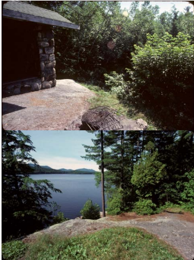
Site #2 in 1977