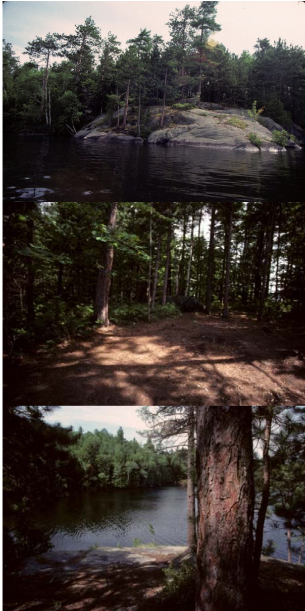
Site #31 in 1977