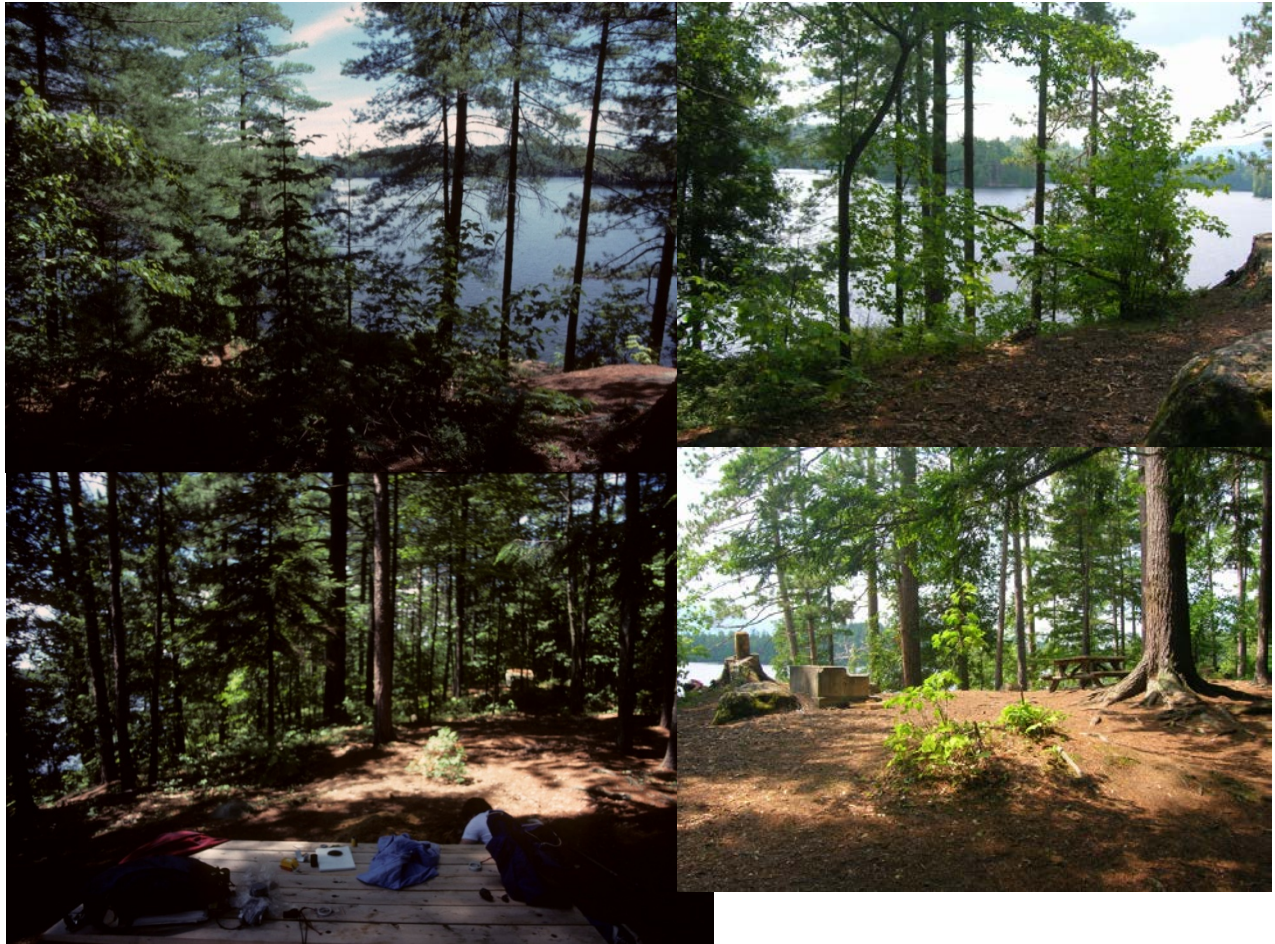
Site #15 in 2009