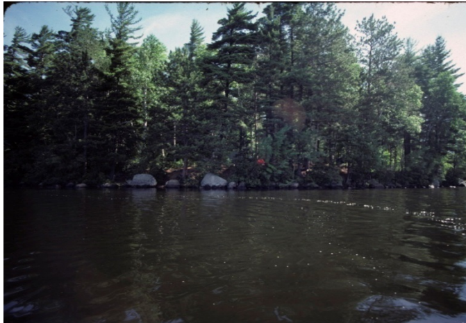
Site #3 in 2009