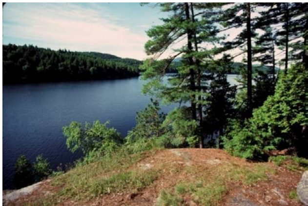
Site #1 in 1977