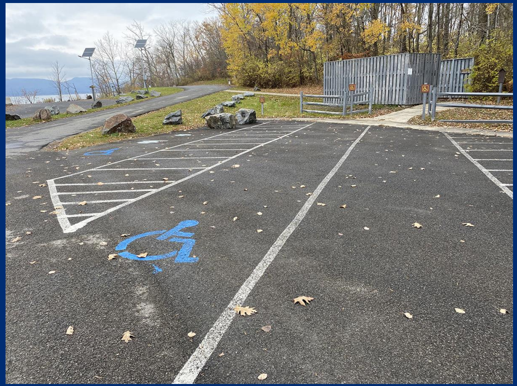
Accessible parking at boat launch