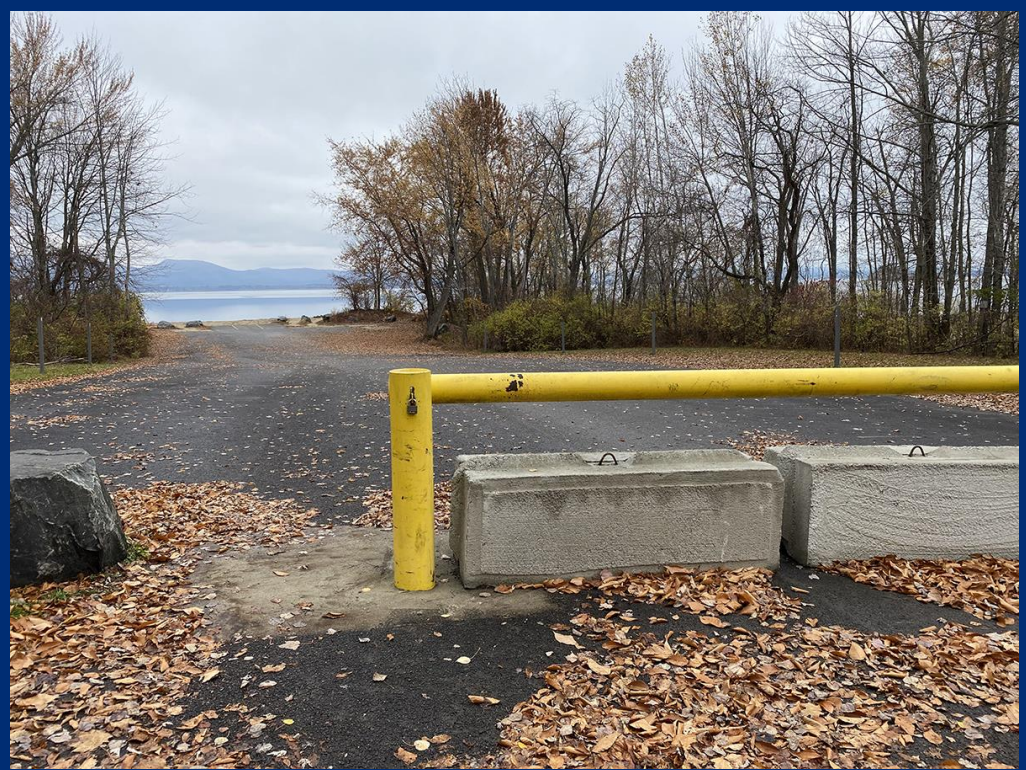
Existing parking area