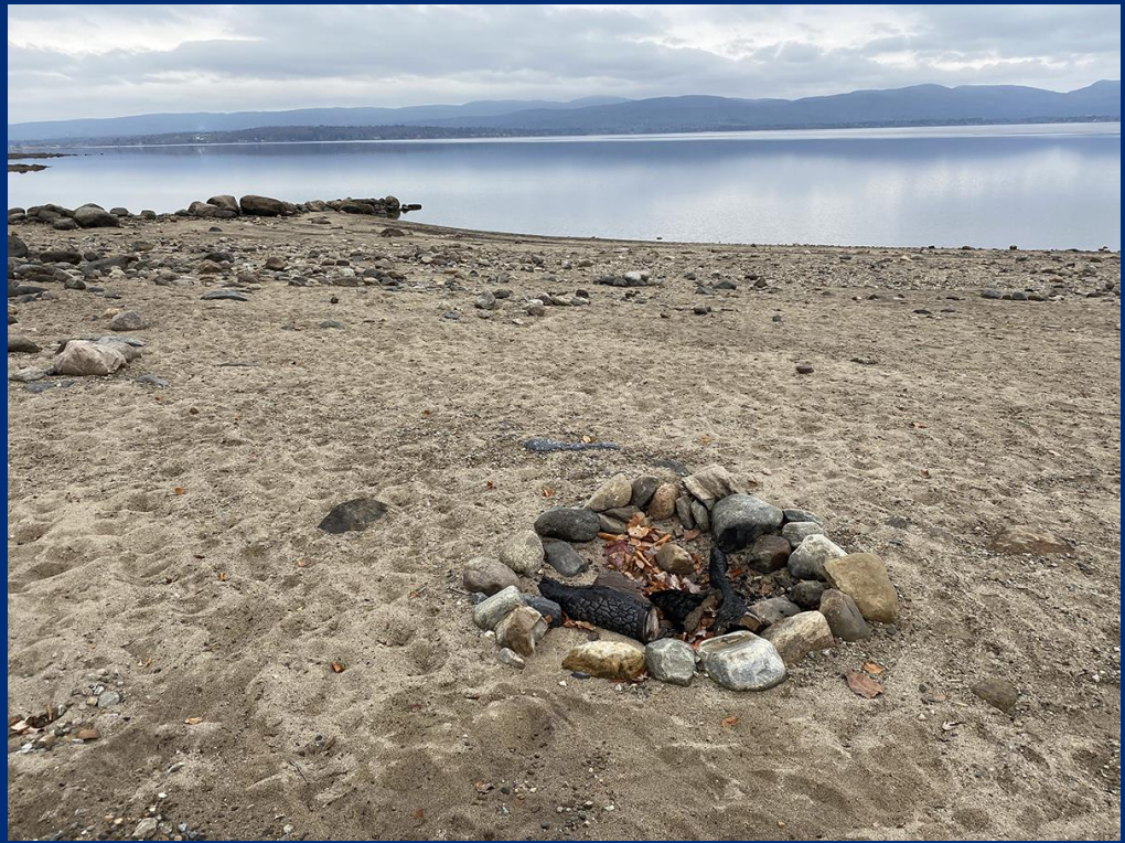
Existing beach area