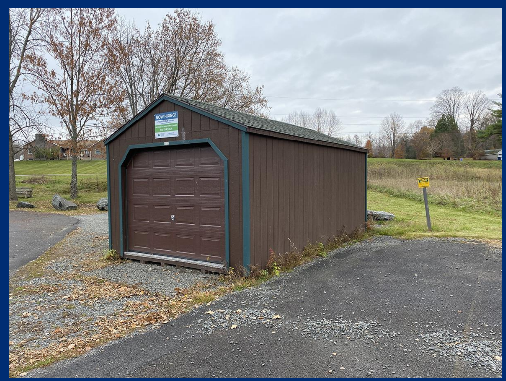
Storage shed for boat decontamination equipment