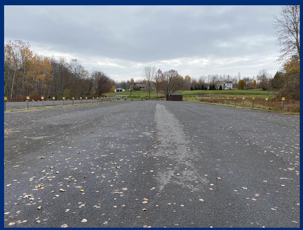
Boat launch parking area