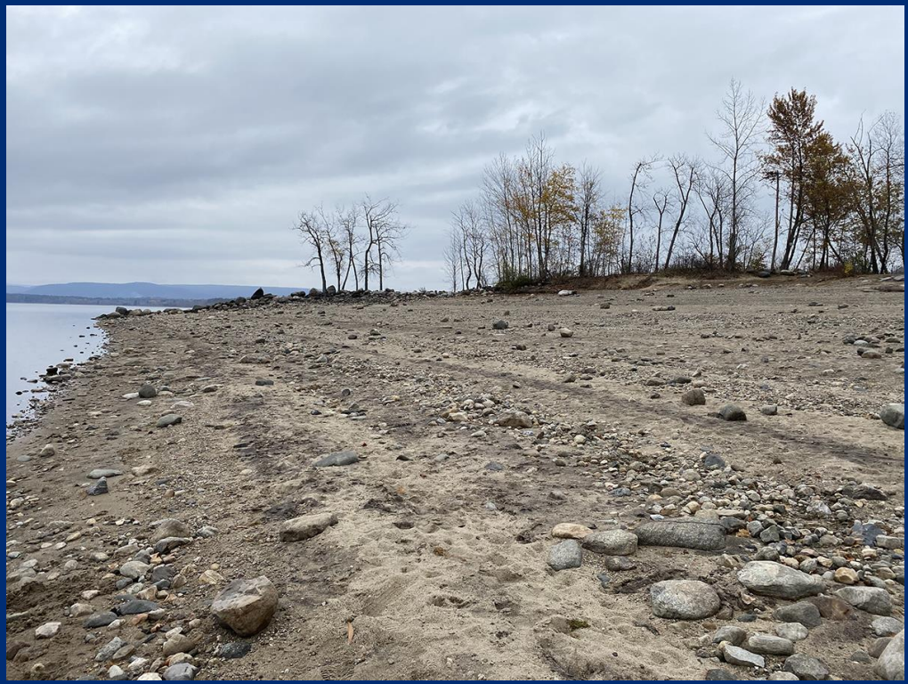
Existing beach area