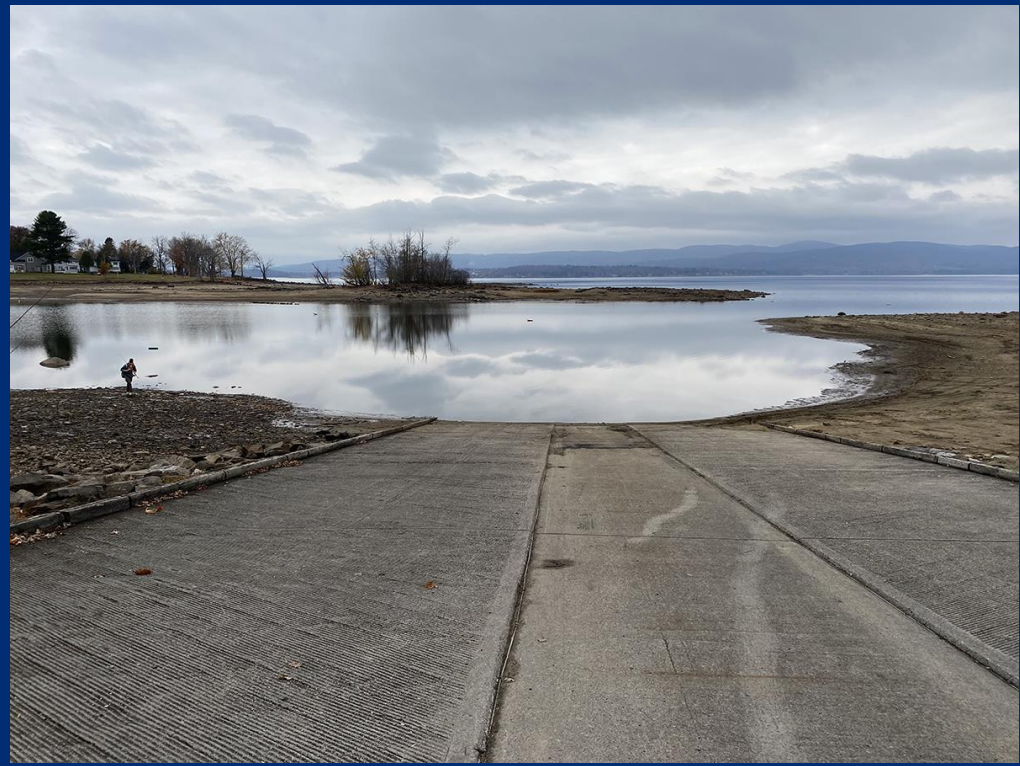
Boat launch in off-season