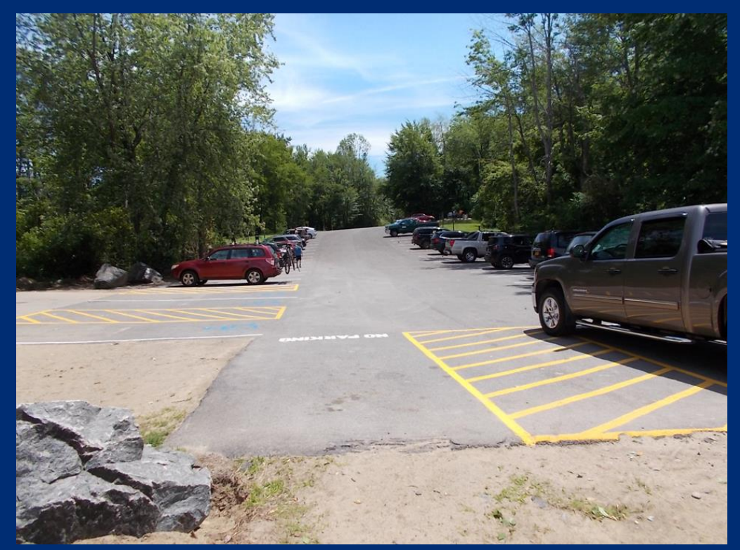
Existing parking area