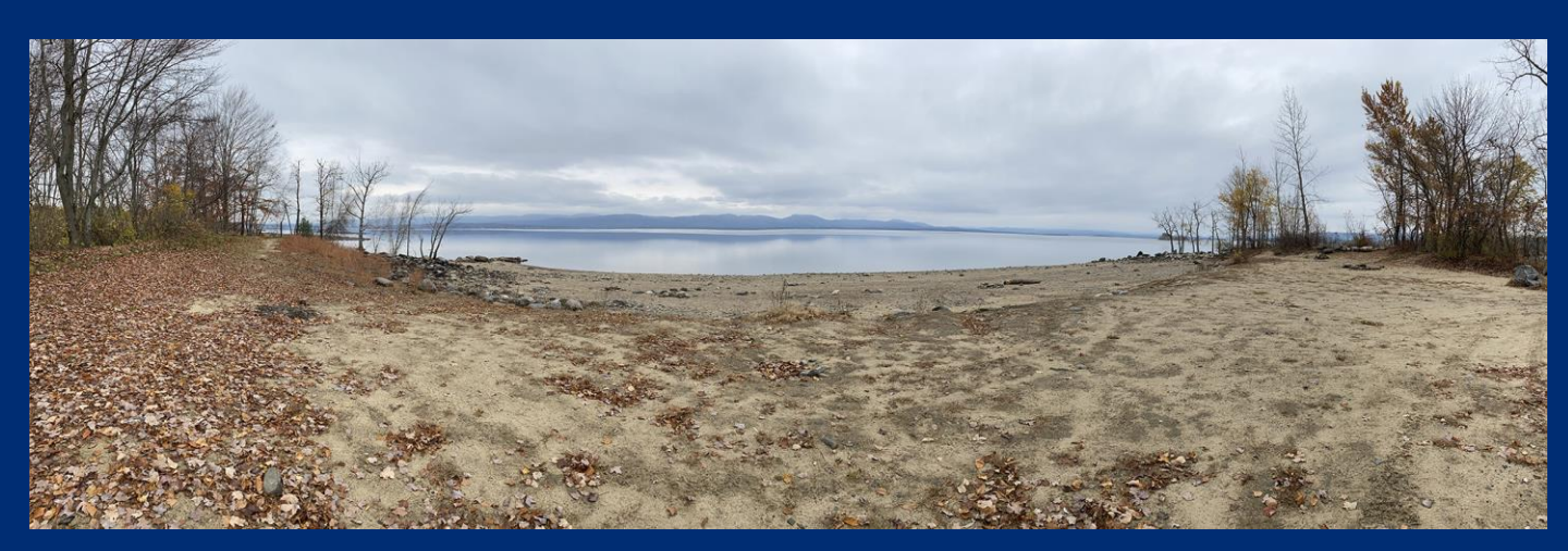
Existing beach area