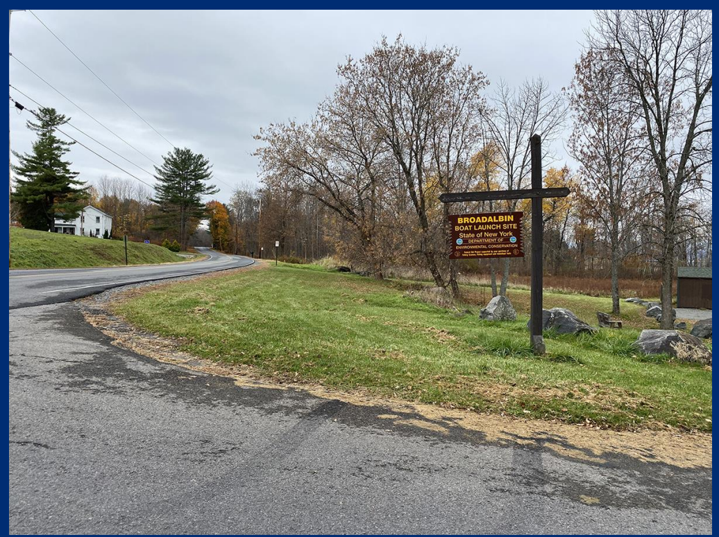
Entrance from Lakeview Road