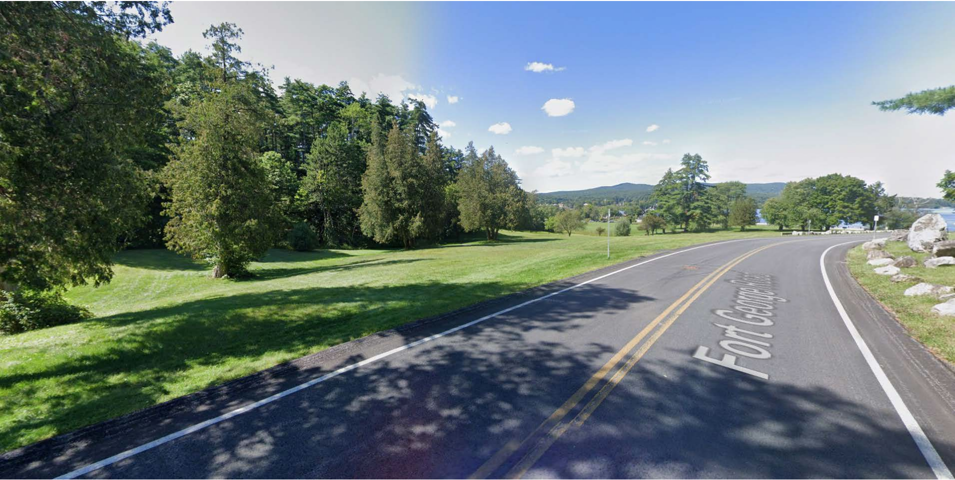
NW View of Proposed Reinterment Site from Fort George Rd, Lake George Battlefield Park, Aug 2023