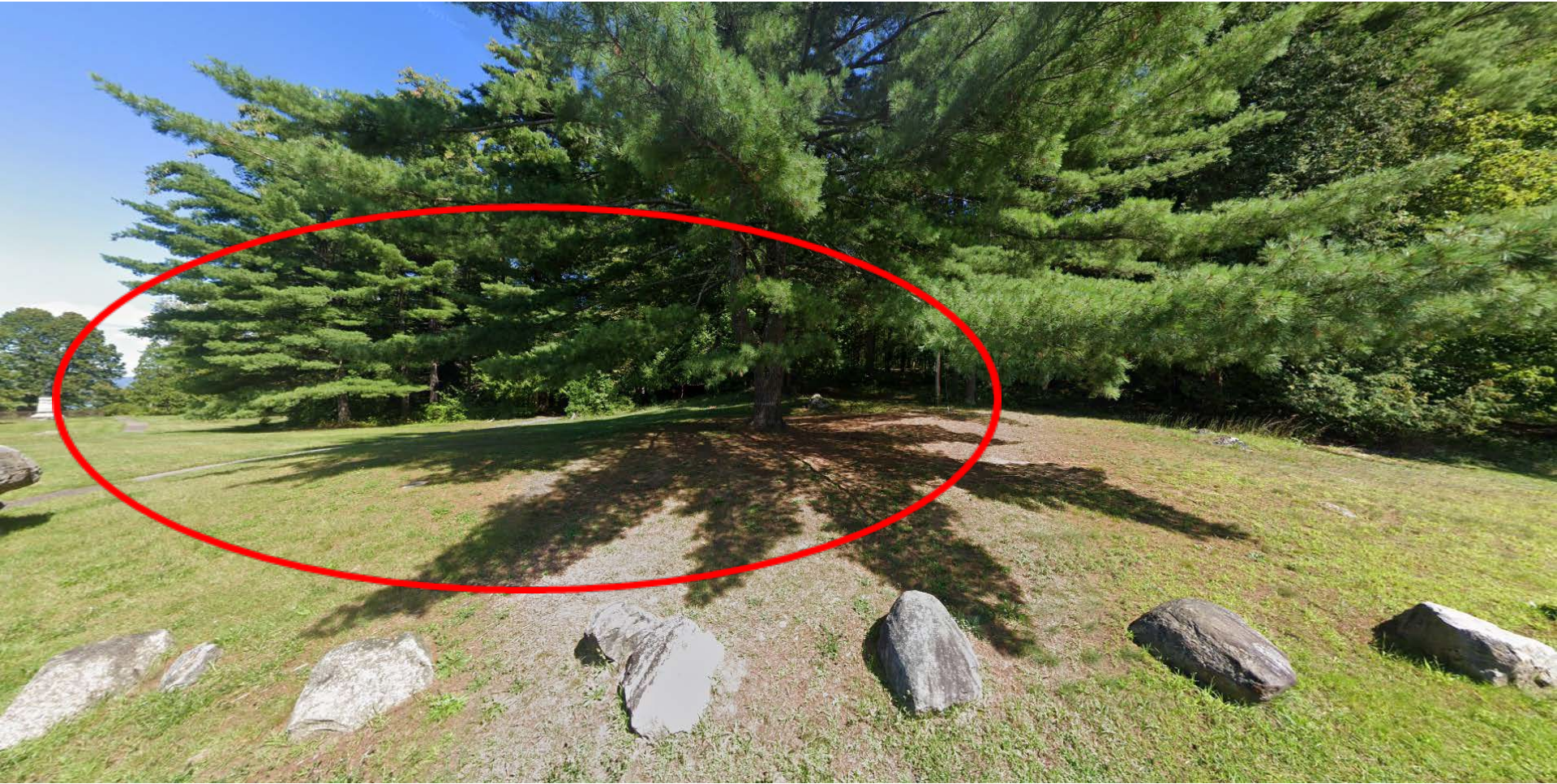
E View of Proposed Reinterment Site from Fort George Rd, Lake George Battlefield Park, Google Street View , Aug 2023