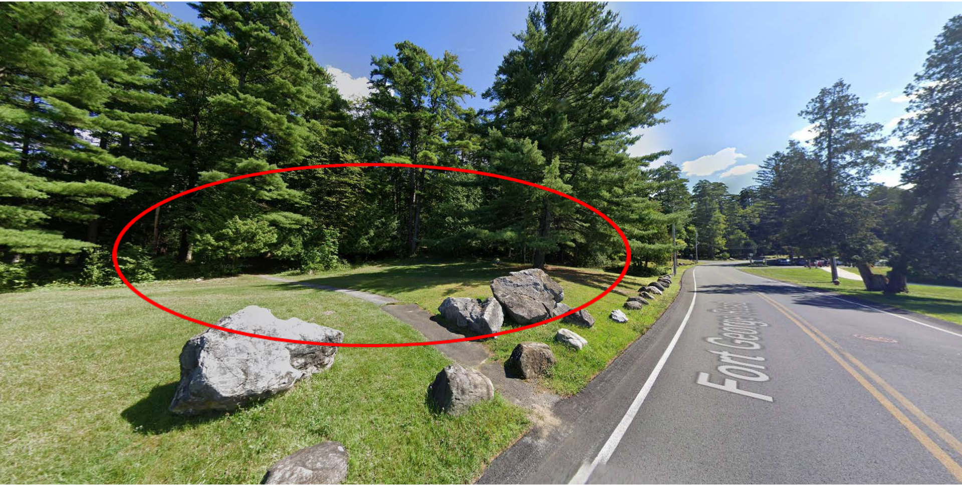
SE View of Proposed Reinterment Site from Fort George Rd, Lake George Battlefield Park, Aug 2023