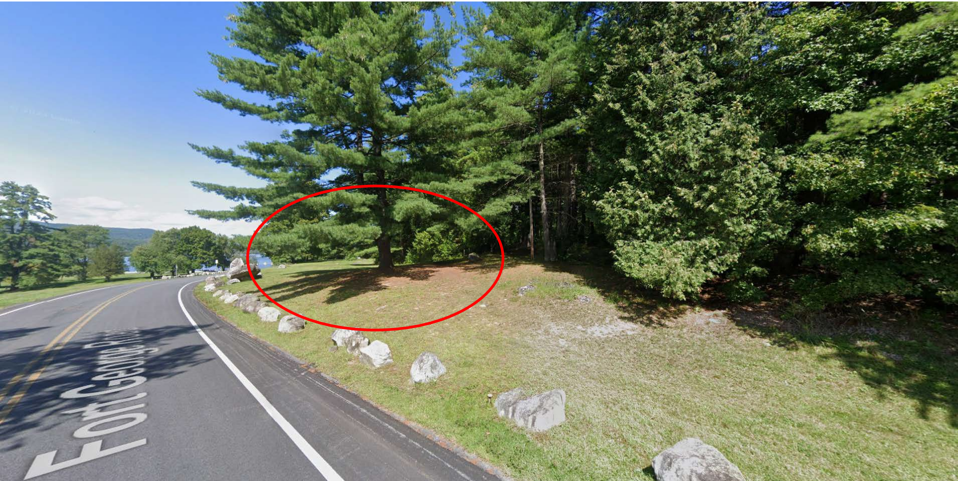
NE View of Proposed Reinterment Site from Fort George Rd, Lake George Battlefield Park, Google Street View , Aug 2023