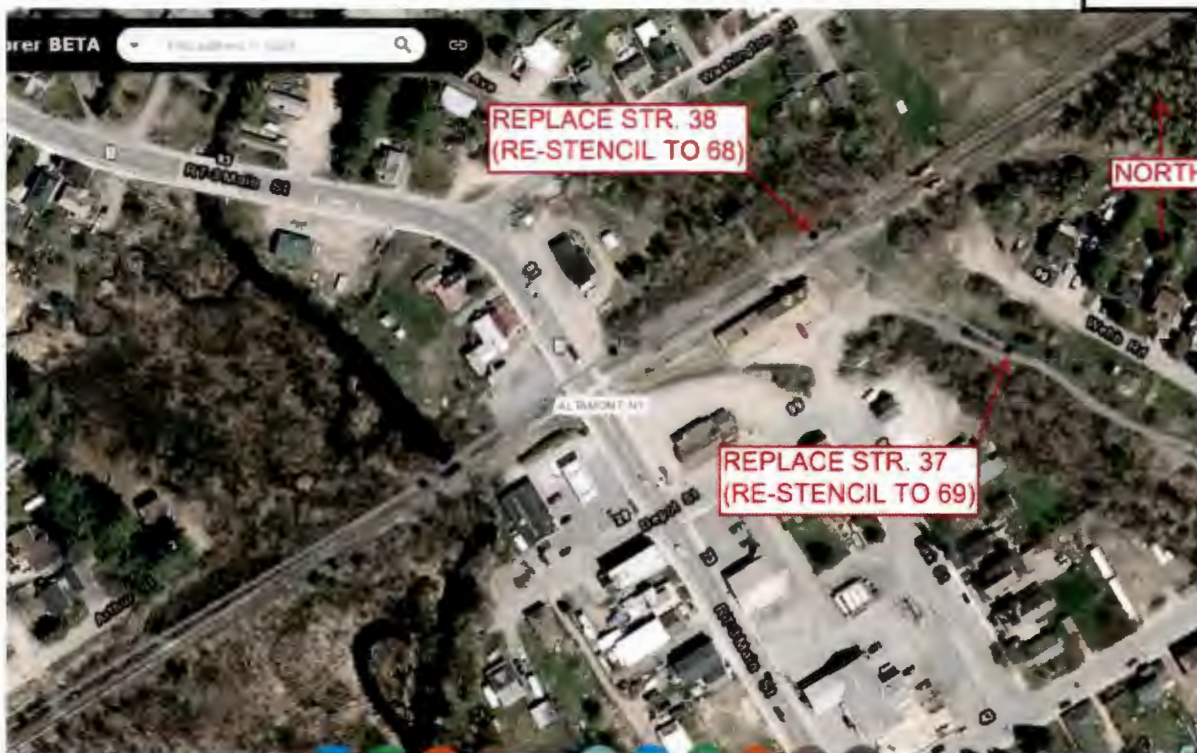
Poles to be replaced