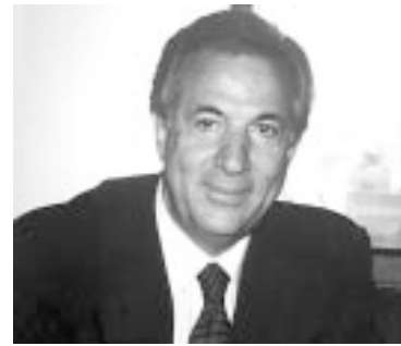
Charles Gargano, Commissioner Department of Economic Development