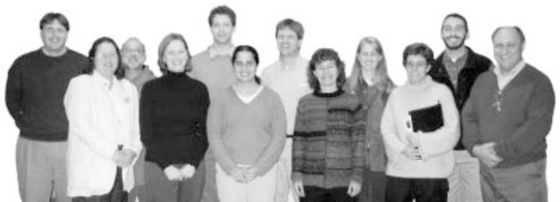
Adirondack GIS Users Group at November 2003 meeting at Plattsburgh State University.

Agency staff often refer to the land use and development plan map as the "APLUDP map," the colors of which represent private and state land use classifications. This map is the basis of all Agency land use decisions.