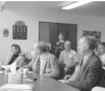
The Agency consulted with DEC on 22 proposals for the development of access opportunities for persons with disabilities.