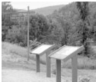
Left: Site Four wayside exhibit area, showing the relocated memorial stone and the newly landscaped exhibit area utilizing native plants; Right: (from left to right) exhibit areas on Sites One, Two and Three.