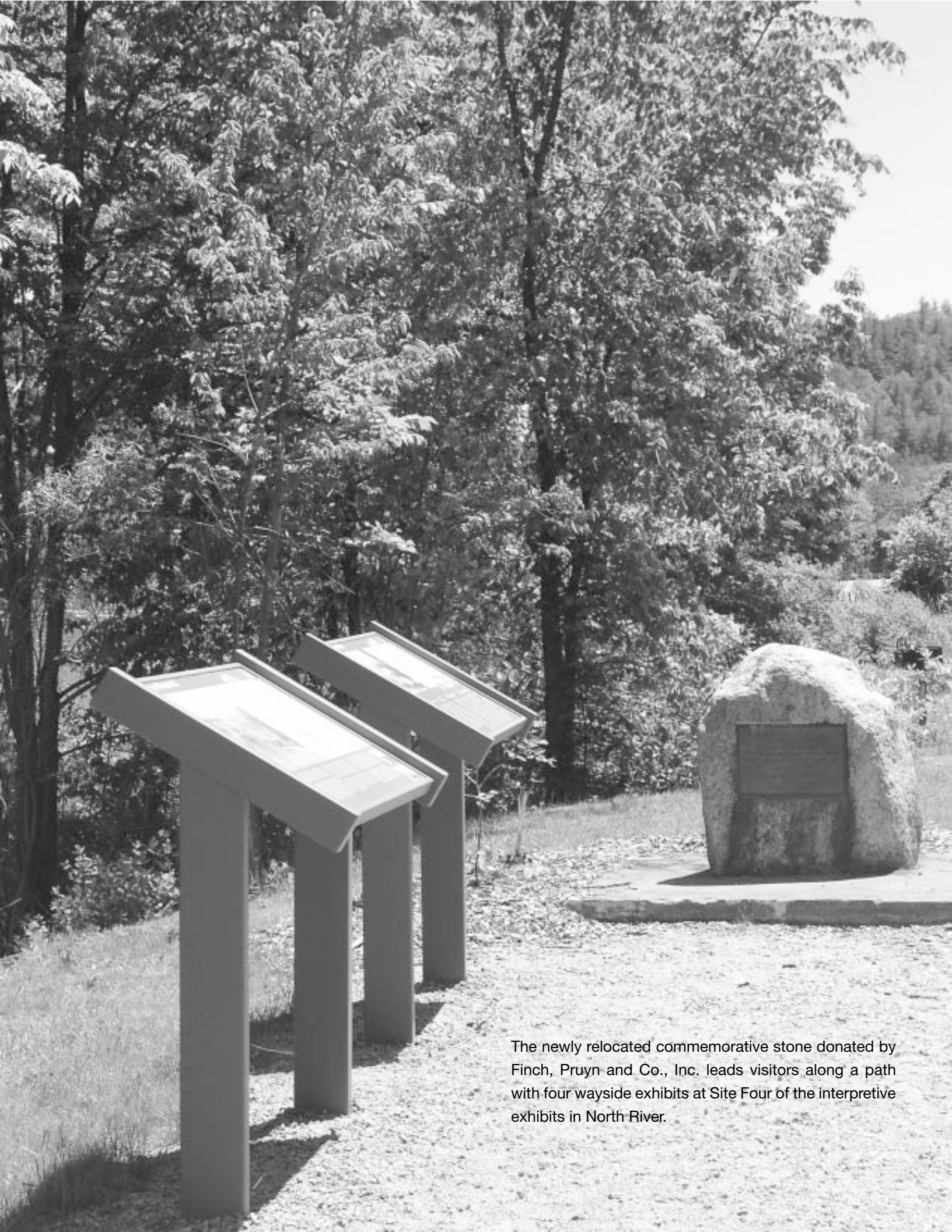
The newly relocated commemorative stone donated by Finch, Pruyn and Co., Inc. leads visitors along a path with four wayside exhibits at Site Four of the interpretive exhibits in North River.