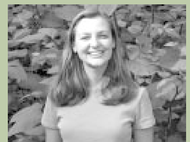
APIPP partners and volunteers carry the important message of invasive plant prevention, early detection and rapid response across the Park. Through monitoring and mapping and encouraging community awareness, APIPP volunteers are playing a significant role in preventing the spread of invasive species.

Invasion of non-native plant and animal species is one of the top threats to the ecology of the Adirondacks. Because of the mostly intact forest of the core of the Adirondacks, many pests have not gained a foothold, but the threat of invasive species is increasing with the growth of human populations, global trade and disturbance of the environment. Effectively dealing with the problem of invasive species presents a significant conservation challenge, both biologically and politically. Stopping potentially invasive species before they spread into and throughout the Adirondacks is the best option for long-term protection.