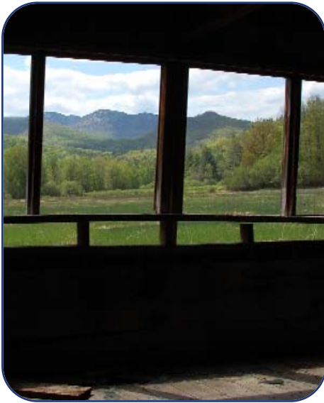
Above: View of Sentinel Range Wilderness Area

The Park represents one-fifth of New York’s land area and has the largest publicly protected area in the contiguous United States—comparable in size to the State of Vermont. The Park is home to 132,000 residents and boasts more than 10,000 lakes, 30,000 miles of rivers and streams, and a wide variety of habitats including wetlands and old-growth forests recognized for their ecological significance. Situated within a day’s drive of nearly 85 million people, the Park is well positioned to offer its unique blend of wilderness solitude, outdoor recreation and community life to the millions of visitors who in increasing numbers see the Park as a unique travel destination. The blend of public and private lands provides the Adirondack Park with a unique diversity found nowhere else.