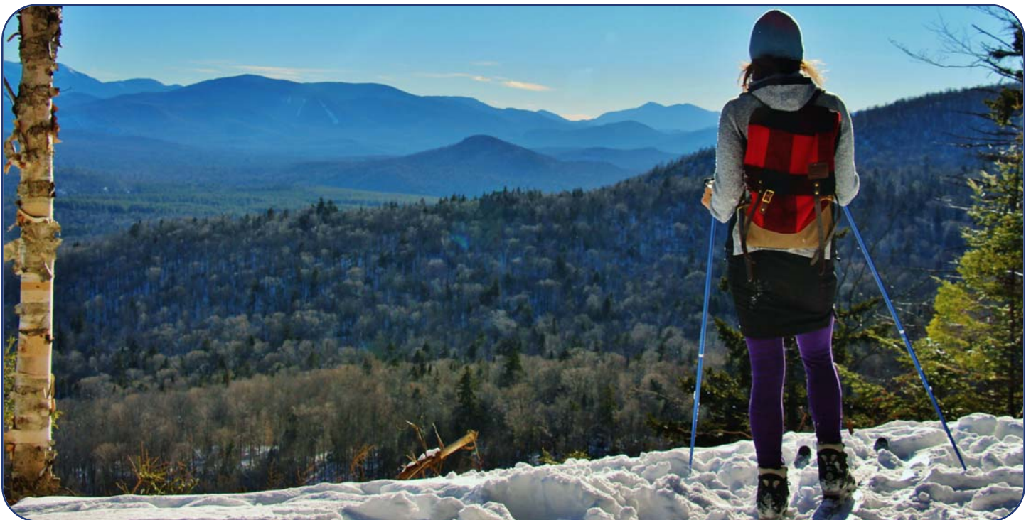
Below: Nordic skier takes a moment to enjoy the snow capped Adirondack mountains.