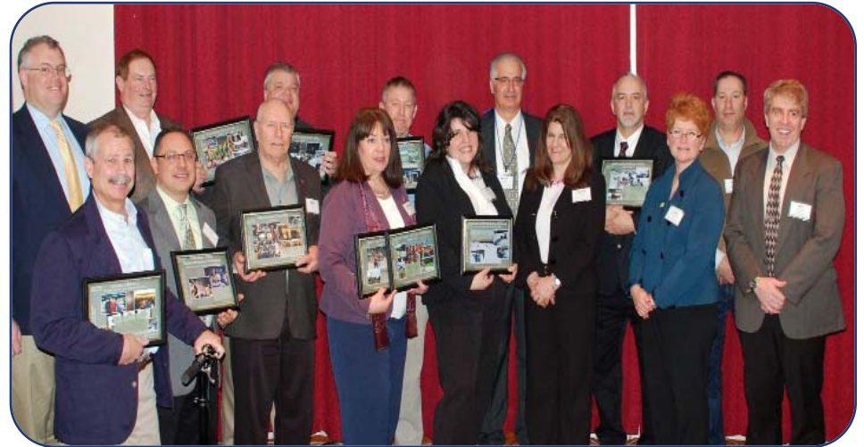
Above: State and local elected officials along with State Agency officials honor the 2014 Local Government Day "Best Community Events" award winners.

The State of New York provides operating funds for the Local Government Review Board through the Agency's budget.