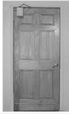
Public Officers Law, Article 7, §105-106