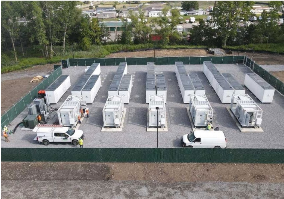
Figure 1: Key Capture 20MW BESS Project, Blasdell, NY