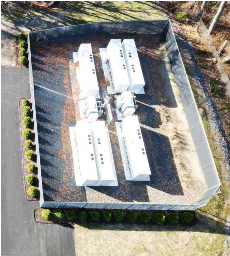
Figure 2: Calibrant Energy 4.9MW BESS Project, Westchester, NY