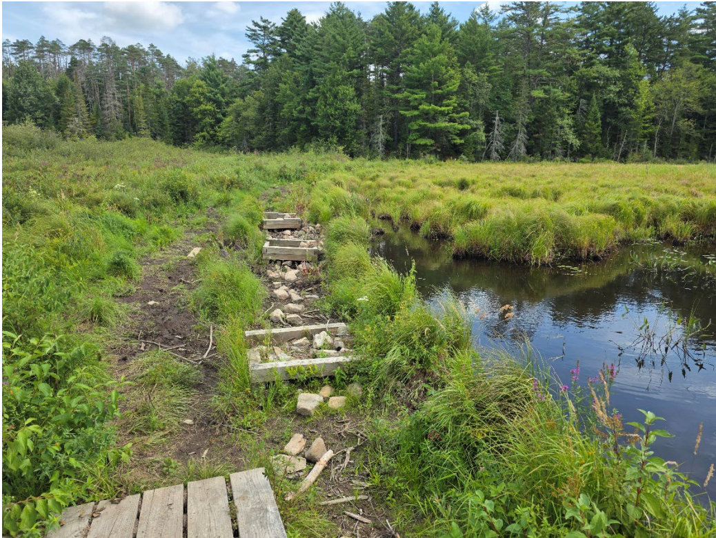
Looking east from the end of the stringer bridge/beginning of the bog bridging